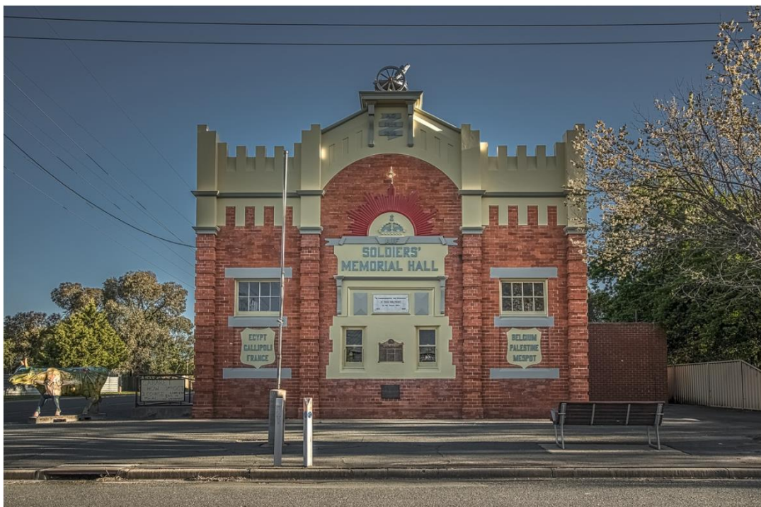
Tallygaroopna Soldiers' Memorial Hall