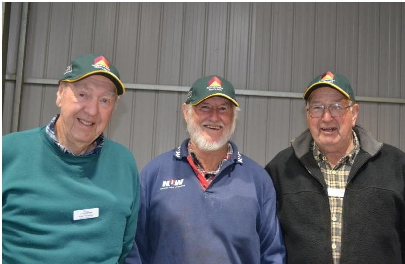
Some of the Tallygaroopna Men's Shed members.