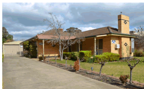
Mooroopna Men's Shed –Opened August 2012