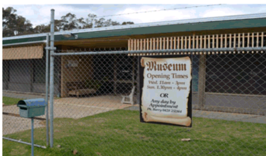
Mooroopna Historical Society finds a home