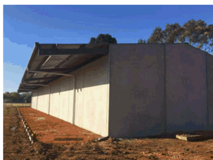
Mooroopna Multipurpose Storage Shed (Under construction Sept 2015)