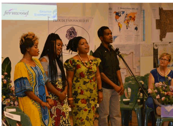
Above: 'We are 4' provided entertainment at International Women's Day.

The evening finished in dance celebration with the local signing group 'We are 4' who are Congolese singers from St Pauls African Choir.