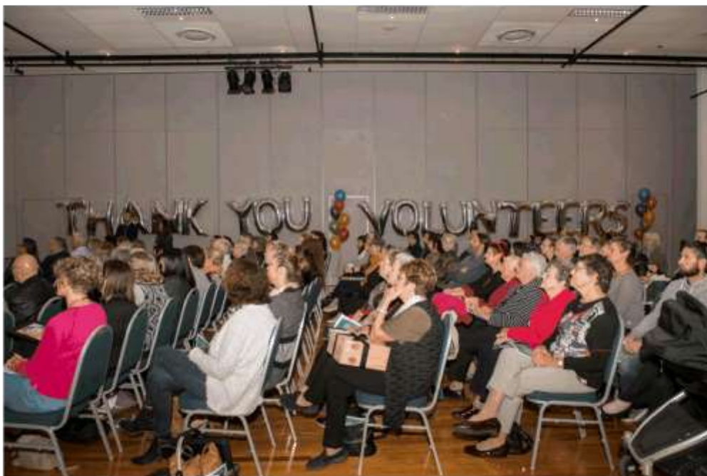
Celebrating and Recognising Our Volunteers