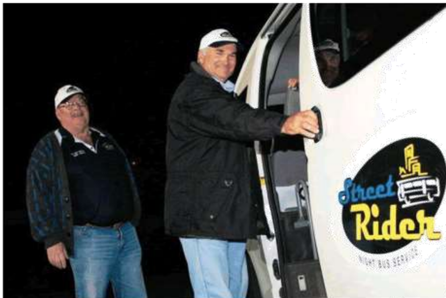
Street Rider Volunteers

(Sourced from the Australian Bureau of Statistics 2016.)