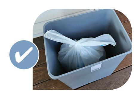
DO securely tie the nappy bag