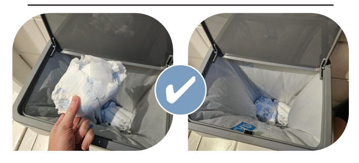
po place nappies in a semi-transparent plastic bin bag and place inside a lidded container.