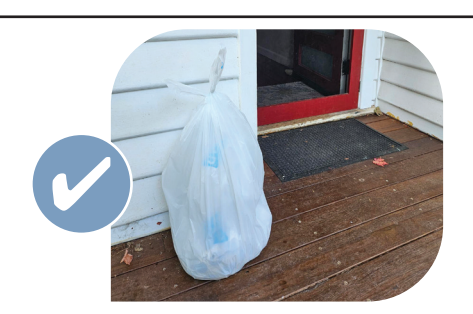
doorstep, mailbox, front gate, or other convenient location for our staff to see and collect from 8am onwards. If your property has a front yard with a dog, please ensure your dog is secured, otherwise your nappies will not be collected.